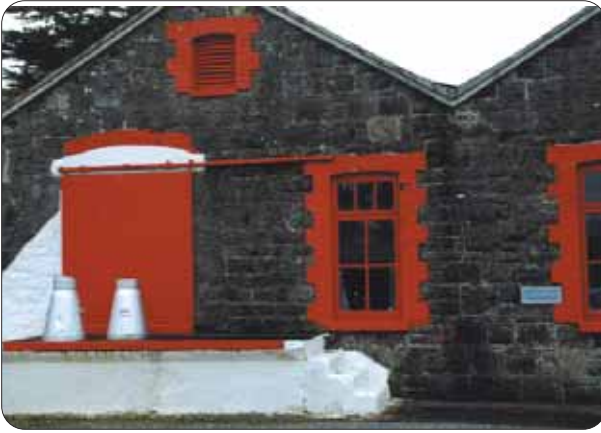
St. Ailbe's Creamery, Emly showing milk cans on the milk receiving platform.