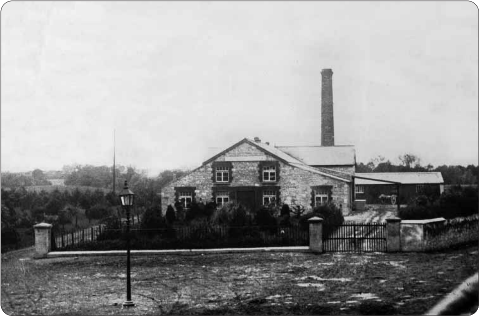
Original Tipperary Co-Op Creamery at O'Brien Street