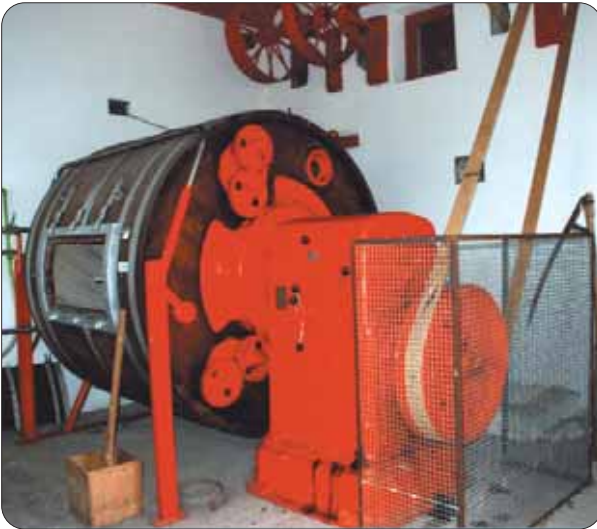
Wooden butter churn

Before the advent of individual electric motors, all machines such as churns, separators and pumps were driven from a central shafting via pulleys and belt. The shaft, in turn, was powered by an oil or steam engine.